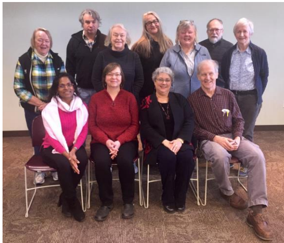
Members of the Shirley DTC at a recent caucus to select convention delegates